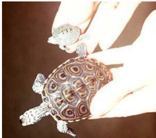
Fig. 1c. New hatchling and a hatchling after six months in our head-starting facility.