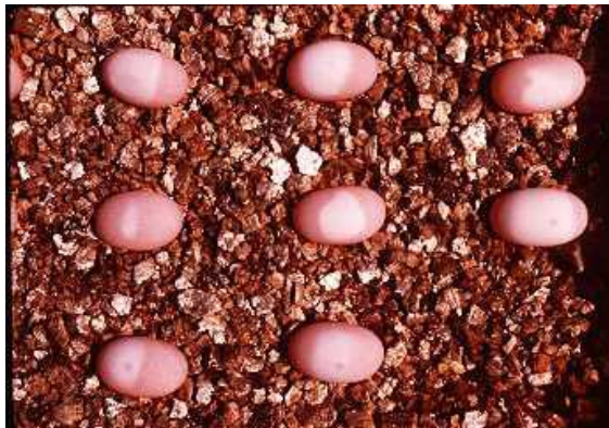
Fig. 1a. Viable eggs in artificial nests.

We have had consistent success with the hatching of recovered, artificially incubated terrapin eggs and with the survival of hatchlings in our rearing facility (Table 1). The hatching success rate ranged from 32% to 49.6% and the survival rate of hatchlings over the 9 to 10 month head-starting period ranged from 61% to 94.5%. Lower hatching success may have resulted from a number of factors: amount of fungal infection in the vermiculite-filled containers or in the incubator, improper functioning of the incubator, number of dehydrated eggs (constant incubation temperature over 30°C often increased dehydration), rotation of the recovered eggs once they were placed on moist vermiculite, or time of day eggs were retrieved. Eggs rotated accidentally after 24 hours of recovery almost never hatched and eggs