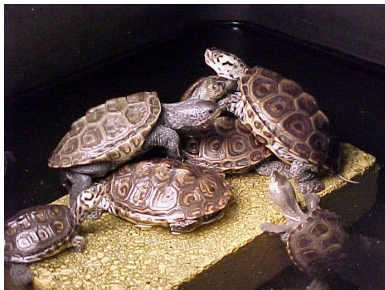
Fig. 1b. Hatchlings basking on brick in tank.