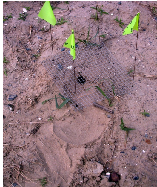
Figure 4. A terrapin nest that had been eaten by a king snake. Note the telltale markings anterior in the lower half of the picture that were created while the snake burrowed into the nest.

Since 2006 researchers have placed hardware cloth in the sand over the nests to prevent crow predation. Although the actual number of nests that have been lost during the last three years have remained relatively similar (Table 1), nest survivorship decreased during 2009 because of an overall lower number of nests (Figure 2). During the summer of 2009, an Eastern kingsnake, Lampropeltis getulus , was actually discovered while eating a terrapin nest and upon capture regurgitated four terrapin eggs (see cover photo). Furthermore, from this experience the research team learned the pattern left by a king snake when it has depredated a nest and can therefore confidently identify nests that were consumed by a snake (Figure 4). Other nest predators that have been observed on the PIERP include